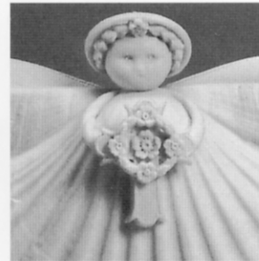
THE GRACE ANGEL, 1998 • Edition of 10,000

The "Charity" angel is the third design in the five-year limited edition series "Flora Angelica" – the flowers of angels. This angel holds a Victorian-inspired horn of plenty filled with beautiful flowers and is crowned with a halo of forget-me-nots. The "Charity Angel" represents what we give to others from the infinite bounty we receive from God.