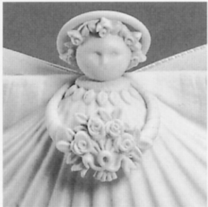
THE FAITH ANGEL, 1995 • Edition of 10,000

"Flowers appear on the earth; the season of singing has come, the cooing of doves is heard in our land." Song of Solomon 2:12