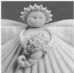
THE CHARITY ANGEL, 1997 • Edition of 10,000

The "Hope" angel is the second design in the five-year limited edition series "Flora Angelica" – the flowers of angels. This angel, with her stem of lilies and elegant leaf headdress, represents hope and new life through the resurrection of Christ.