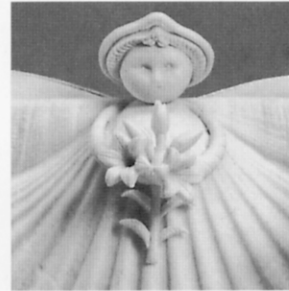
THE HOPE ANGEL, 1996 • Edition of 10,000

The "Faith" angel is the first design in the five-year limited edition series "Flora Angelica" – the flowers of angels. This angel holds a ribboned bouquet of roses and is crowned with a delicate headdress of roses and leaves, symbolizing faith and love.